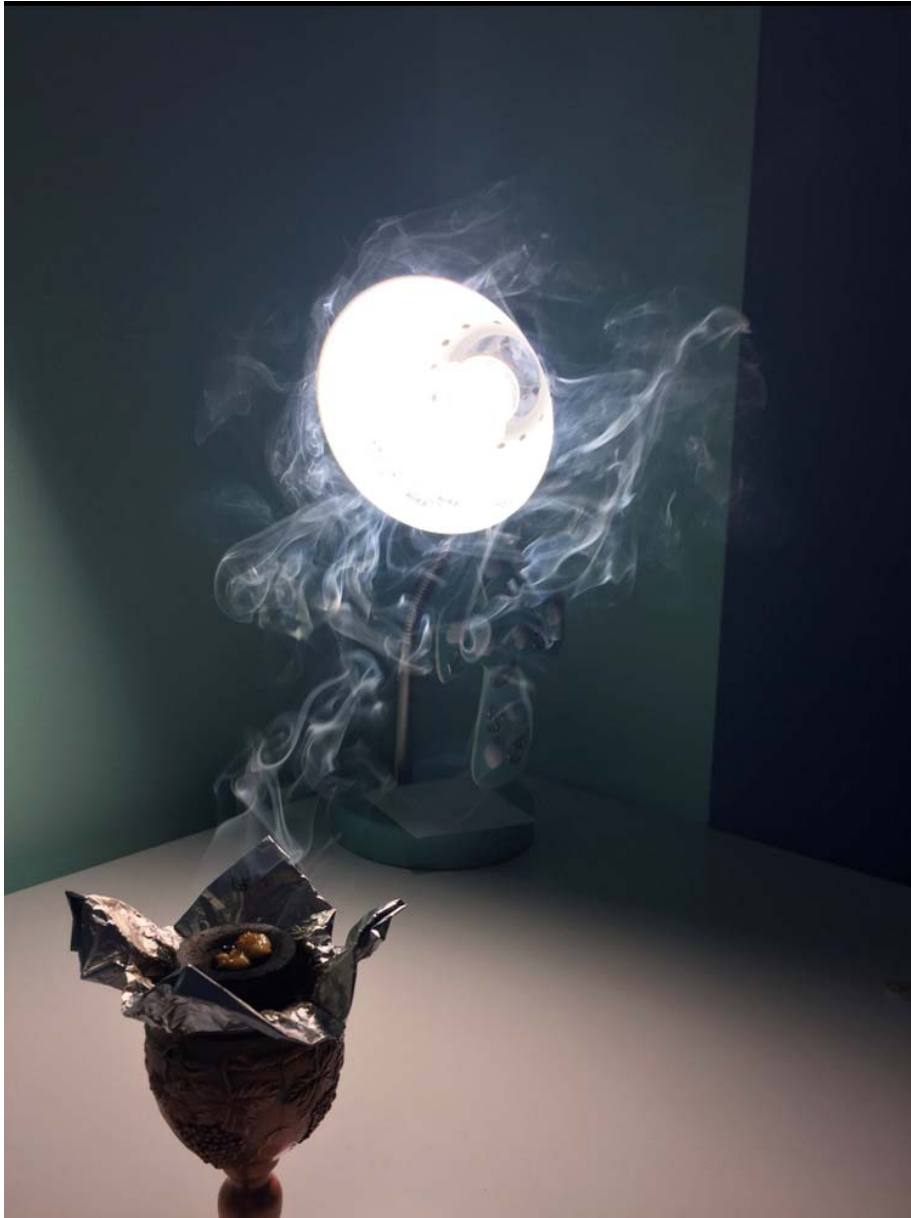
The Light - Good